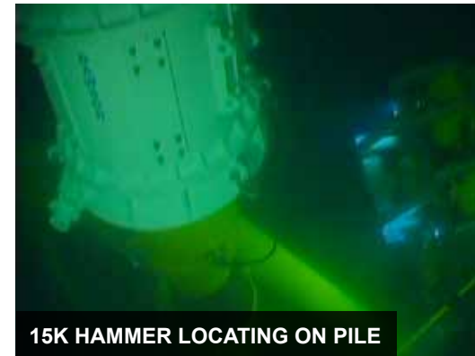
15K HAMMER LOCATING ON PILE