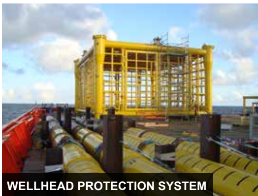
WELLHEAD PROTECTION SYSTEM