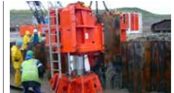
Specialist Work >