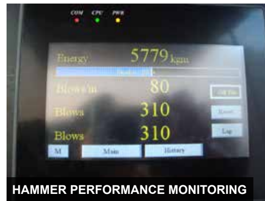
HAMMER PERFORMANCE MONITORING